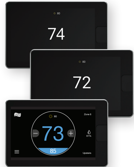
EcoNet Zone Control RECTL700ZON